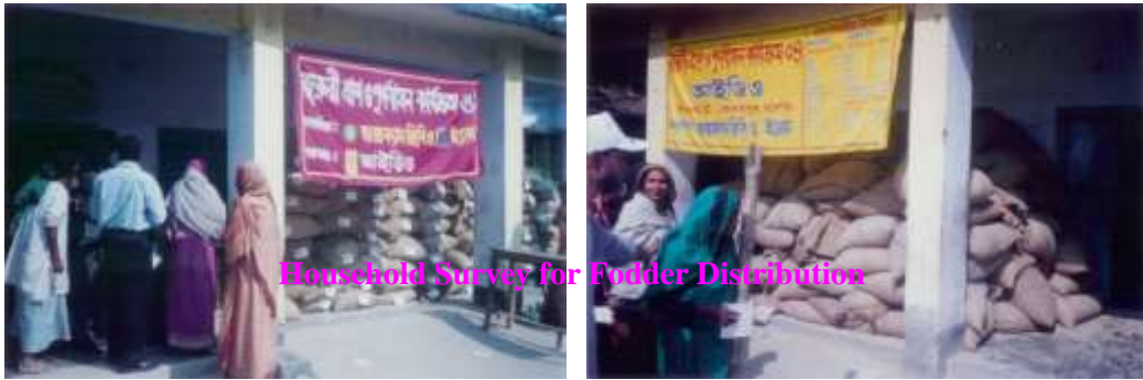
Household Survey for Fodder Distribution

A total of 2291 packs Fodder were (oil cake 6 kg., wheat bran 18 kg., rice bran 36 kg, Total: 60 Kg.) distributed among 2291 family